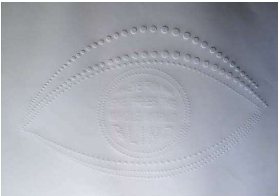
Figure 2. A student’s interpretation of Mahatma Gandhi’s “An eye for an eye makes the whole world blind.”

Influenced by knowledge of history, social and cultural development, technical knowledge and personal preferences, the students have resources to articulate the complex communicative network of communication by combining the persuasive wealth of visual vocabulary with typography. For one student, after deciding on the quote, she begins to critically analyze it by