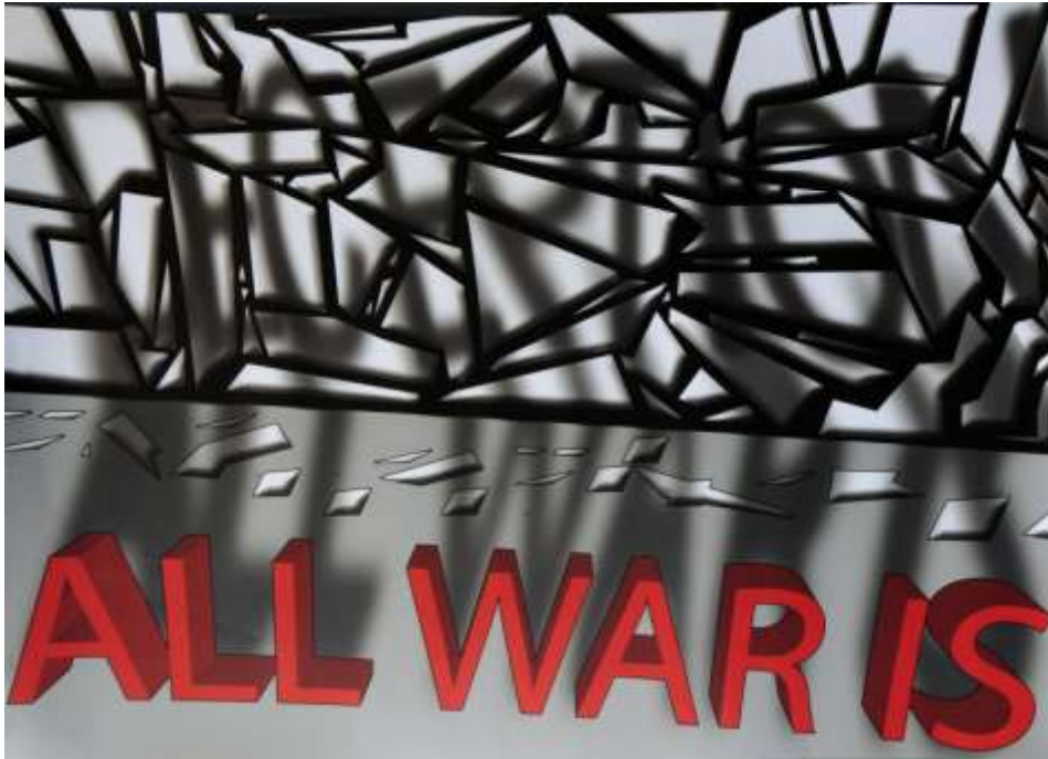
Figure 3. A student's interpretation of Sun Tzu's "All War Is Deception."

A good story brings about emotion. A student reports that while it is difficult to portray emotion in a two-dimensional medium, she attempts to translate emotion by giving her viewers a sense of time and space. She places various design elements such as thick lines which are dynamically placed in her composition. As a result, she creates eye movement which can build suspense, drama, and conflict which work together to allow her viewers to see a "big picture" in her overall composition. She chooses ancient Chinese military strategist, Sun Tzu who authored the book The Art of War (figure 3). In providing a contextual basis for the particular quote, the full original quote, 兵者，诡道也。故能而示之不能，用而示之不用，近而示之远，远而示之近, is translated by the student into "War is also about deceptions. When you are capable, feign incapability. When you are good at deployment of units, feign that you are incapable. When you are near, feign that you are far. When you are far away, feign that you are near." The importance of deception in warfare is not to be underestimated because deception increases the change of a quick victory. Yet, the highest accomplishment in warfare is victory without fighting, i.e. to drive away the enemy without using a single soldier (Fu & Yang, 2006).