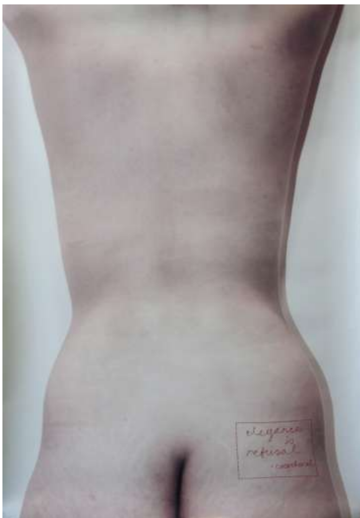
Figure 5. A student's interpretation of Coco Chanel's "Elegance is refusal."

QUESTION 4: Identify the emotional tone in your expressive lettering and relate it to a plot in which you identify the conflict and climax in your expressive lettering. To understand "conflict," identify "problem" area(s) in your composition that creates tension in your composition. As for "climax," link the identified problem area(s) towards a strong focal point in composition that either enhances or distracts from your overall design.